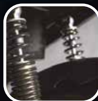
Double Rear Shocker