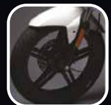
Bigger/Wider Tyres For Better Road Grip