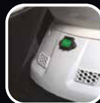
External Charging Point