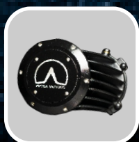
Side BLDC MOTOR