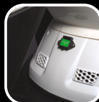
External Charging Point