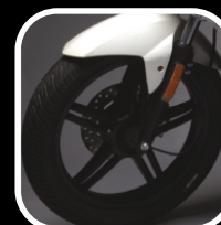
Bigger/Winder Tyres For Better Road Grip