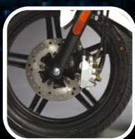
Double Disc Brake with CBS