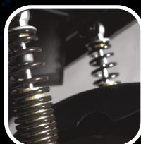
Double Rear Shocker